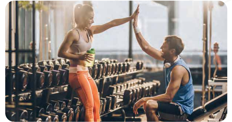
Gyms, outdoor wellness and fitness areas