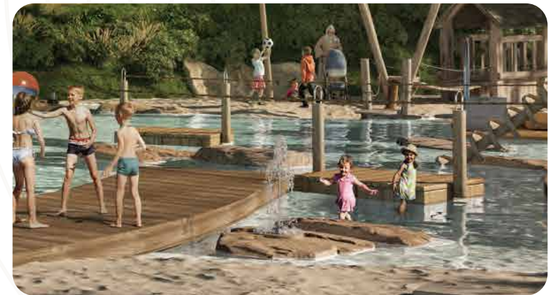
Swimming pools, splash pads and kids' play areas