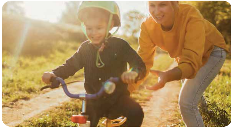
4.5 km of pedestrian tracks and 5.2 km of cycling trails