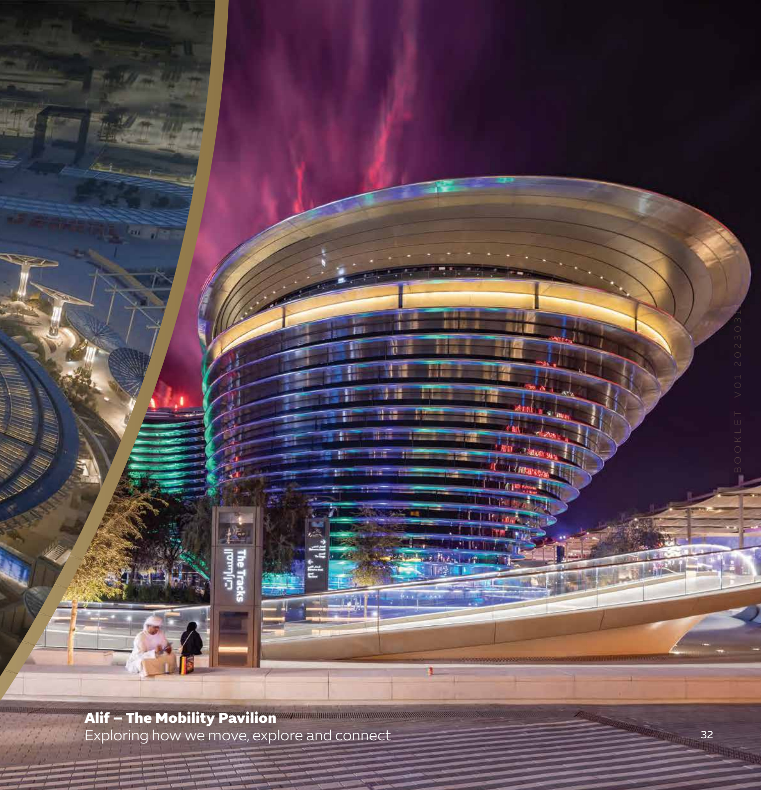
Alif – The Mobility Pavilion Exploring how we move, explore and connect