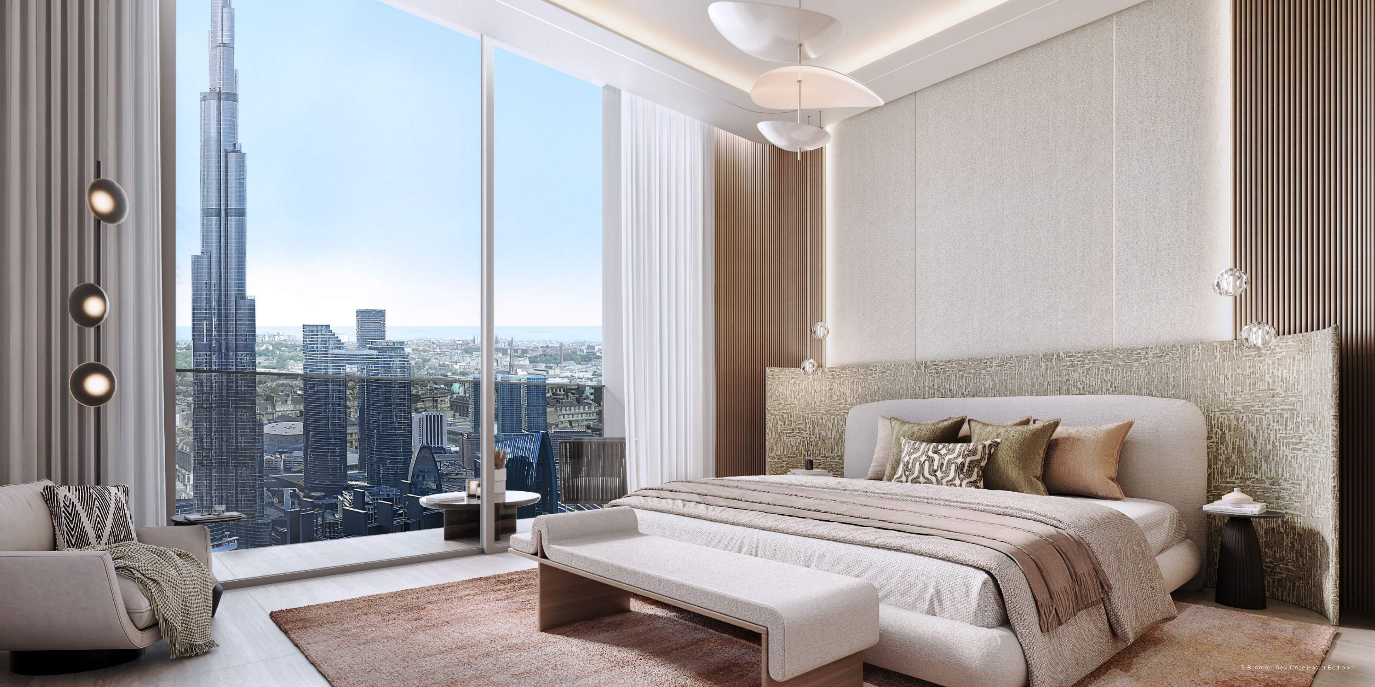
3-Bedroom Residence Master Bedroom