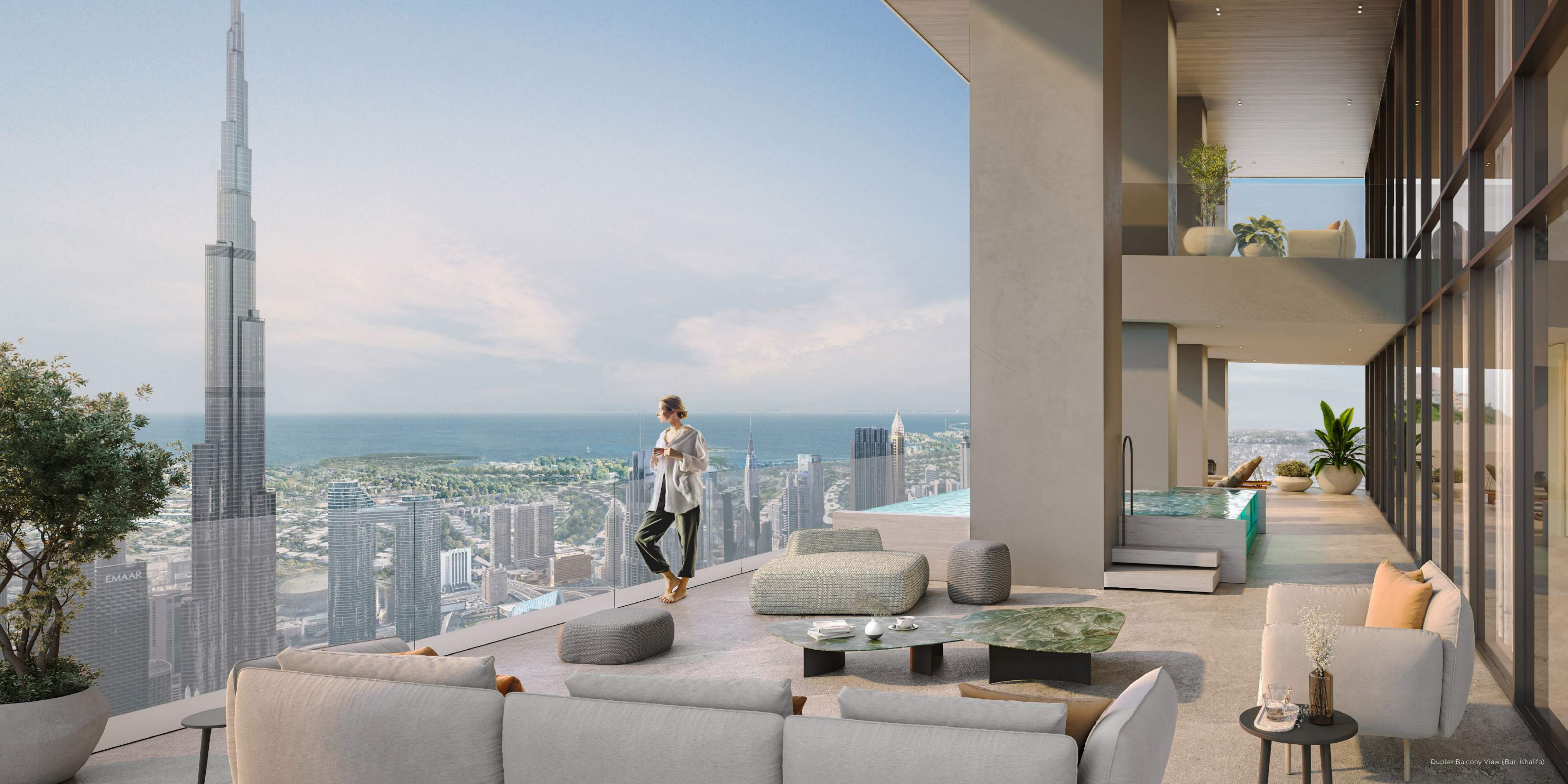
Duplex Balcony View (Burj Khalifa)