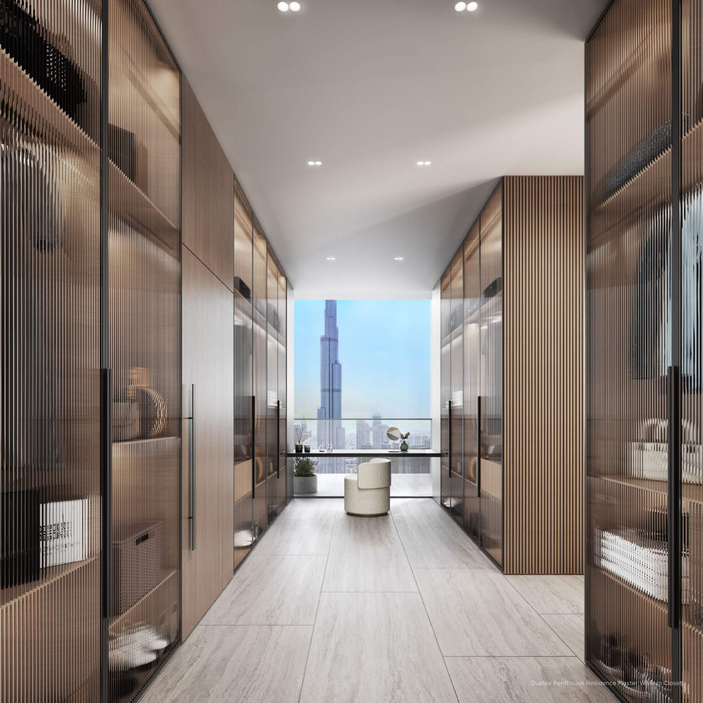
Duplex Penthouse Residence Master Walk-in Closet